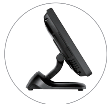
Full Extended Mode

The XT-3815-G2 provides the selection of two foldable bases, the curvy slim GEN7E base and the larger but practical GEN8E base. The foldable base can be configured into "Flat Folded Mode" to save the shipping package volume, "Low Profile Mode" to allow greater interaction between the cashier and the customer, and the traditional "Full Extended Mode". All this can be achieved with a simple pull of the hidden lever.