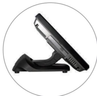
Low Profile Mode