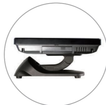
Flat Folded Mode